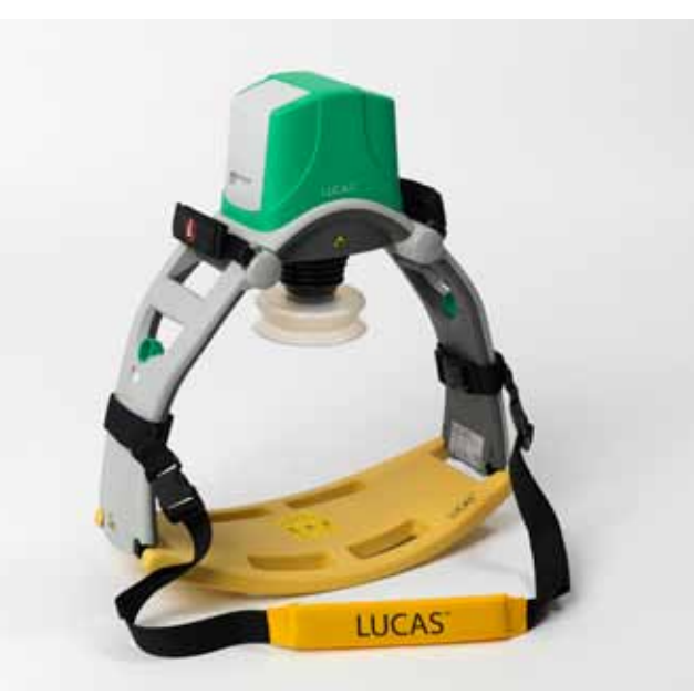
The LUCAS 2 chest compression system is shipped with one battery, patient straps, three suction cups, a carrying bag and the instructions for use. Also available are additional accessories and power options designed to meet your needs.