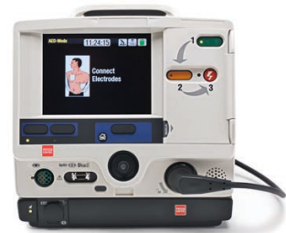
AED Mode for BLS teams