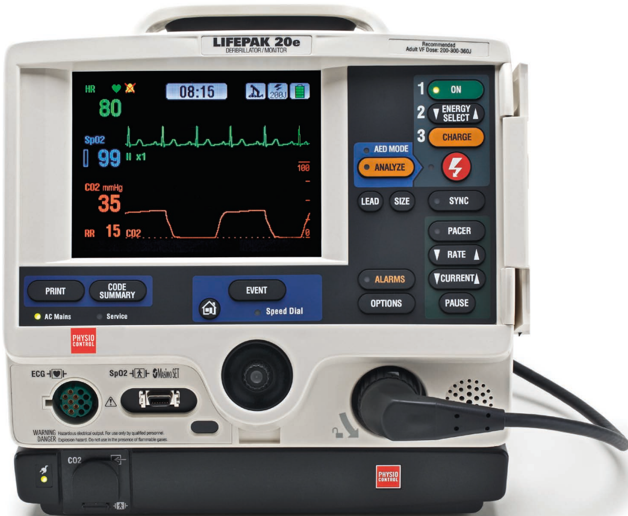
Manual Mode for ALS teams